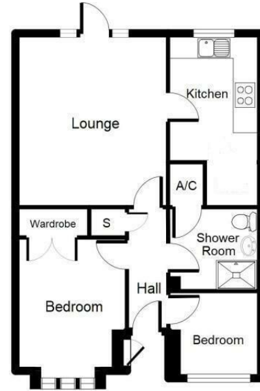
Approx. total area: 50.1 sq. metres

PLEASE NOTE: CURRENT COUNCIL TAX BAND IS B.